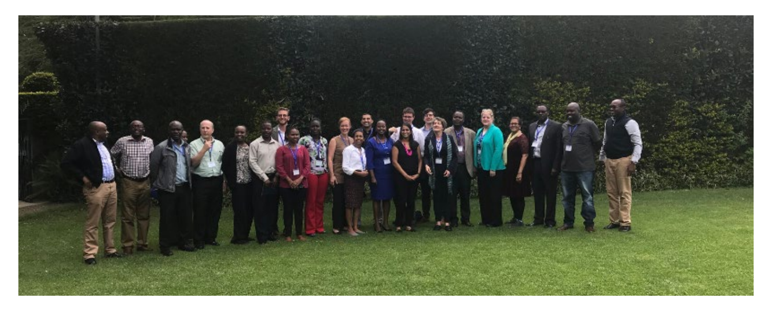
Attendees of the 2019 Strategic Planning meeting in Eldoret, Kenya.

The following report provides a snapshot of AMPATH's research activities from July 1 – December 31, 2019. It includes progress updates from 52 research projects active during this period. Each update includes a summary abstract of the project's aims, an update on progress made during the reporting period, and the project's objectives for the next 6 months. Each report was provided by the project's Principal Investigator or their designee and, with the exception of formatting, are presented here largely unedited.